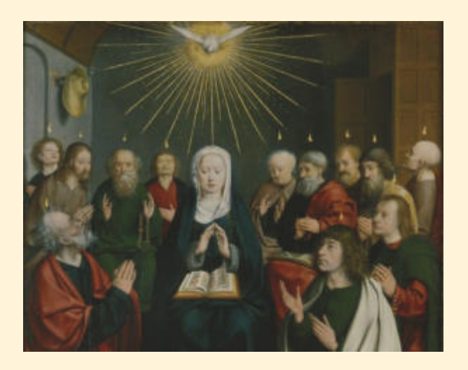
"Come, Holy Spirit, fill the hearts of Thy faithful and enkindle in them the fire of Thy Divine love."